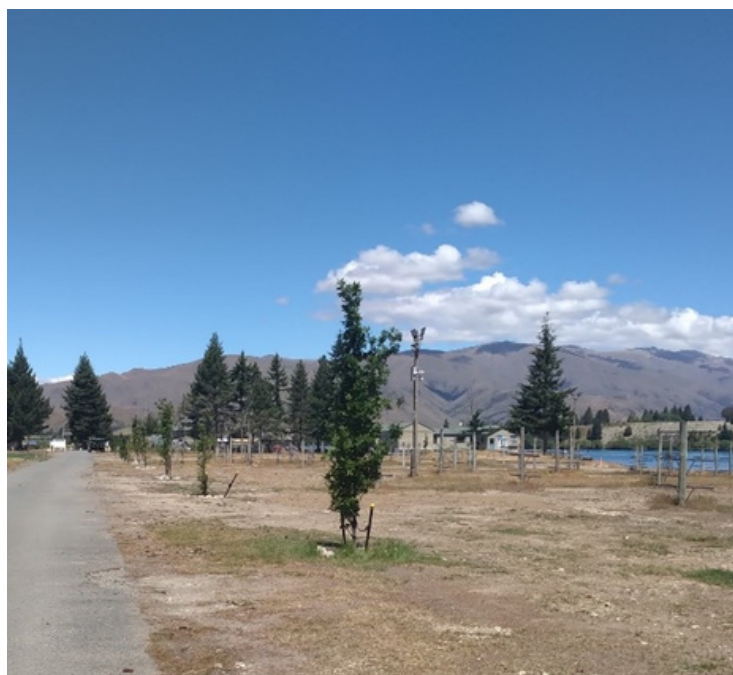
Trees on the road side of the boat park

Other projects include levelling of the trailer park just inside the gate. There was a considerable depression which sometimes flooded.