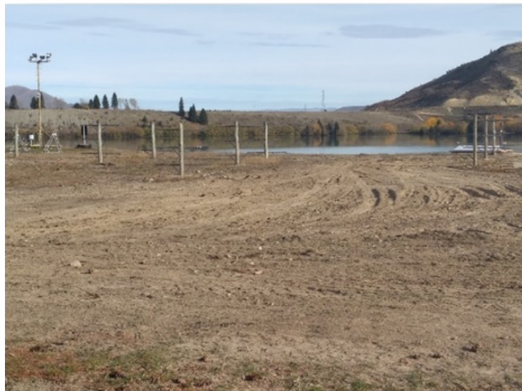
A view of the boat park after the tree removal

South Island Rowing are looking forward to welcoming schools to Twizel for the 2024 NZ Secondary School Championships. Maadi is the largest regatta that South Island Rowing host and considerable work has been undertaken to ready the course for the 2024 event.