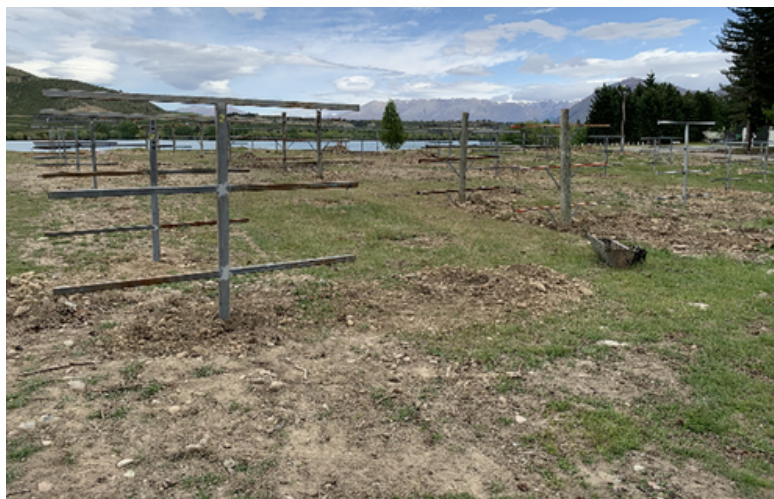
Racks realigned at the west end of the boat park

It is hoped that the majority of the new racks will be installed before the regatta but it will be a 2 year project.